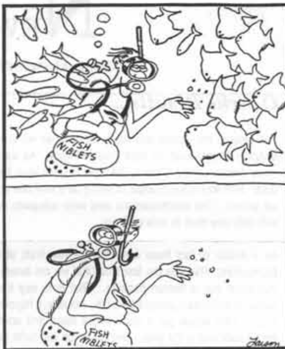
Nature's subtle signs of danger