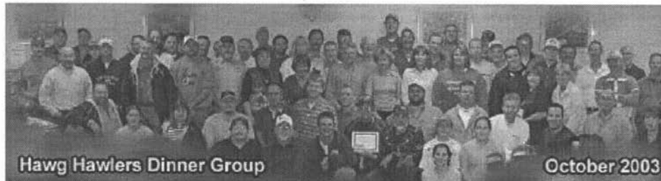
Hawg Hawlers Dinner Group