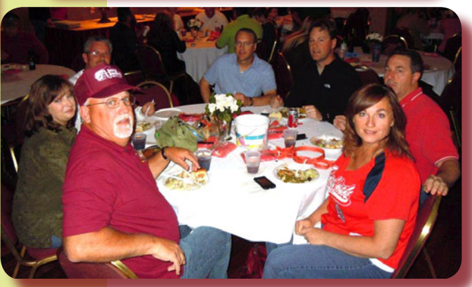
Thank You 2011 Hawg Hawlers Bass Club Members!