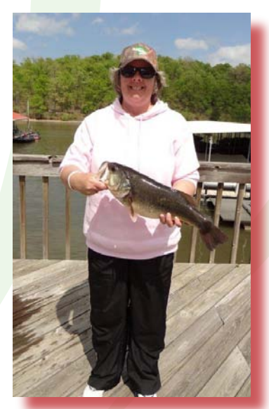
Hawg Hawlers Bass Club