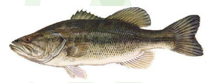
TABLE ROCK LAKE

Take Highway 65 South to exit EE. Go West on EE 3 miles to Highway 160/13. Turn left on Highway 160/13 to Branson West, and into Kimberling City. As you come down the big mountain that curves, the golf course is on your right and the Table Rock Lake Campground is on the left. A Schooner Creek Resort billboard sign is on the left where you will turn on Kimberling Blvd. Curve around on Kimberling Blvd. 2 blocks to another Schooner Creek Resort sign on the left. Turn left on Schooner Creek Road and this will bring you right to the office. This route is approximately 45 miles.