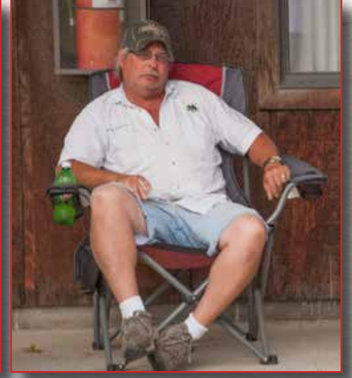
Hawg Hawlers Bass Club