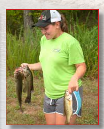
Hawg Hawlers Bass Club