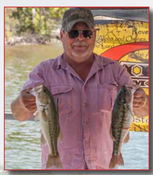
Table Rock cont.