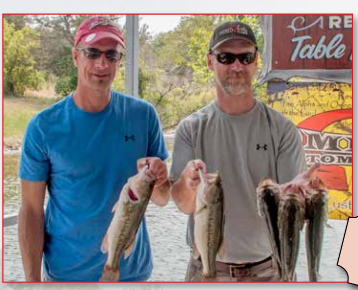
Table Rock cont.