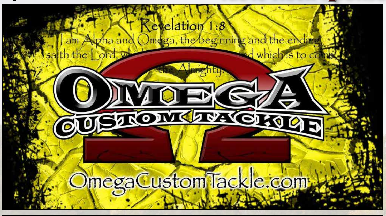
Table Rock was sponsored by OMEGA CUSTOM TACKLE . Please support them when you are considering new tackle, custom apparel or accessories.

At OMEGA Custom Tackle , attention to detail is paramount.