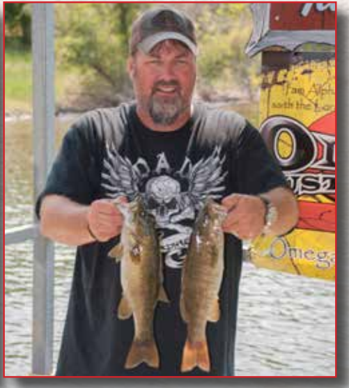
Hawg Hawlers Bass Club