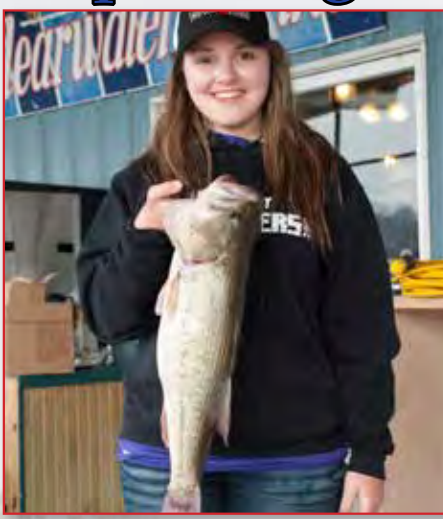
Andi Himstedt Clearwater - 7.91 lb