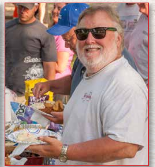
Hawg Hawlers Bass Club