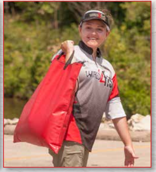
Hawg Hawlers Bass Club