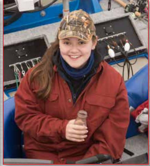
Hawg Hawlers Bass Club