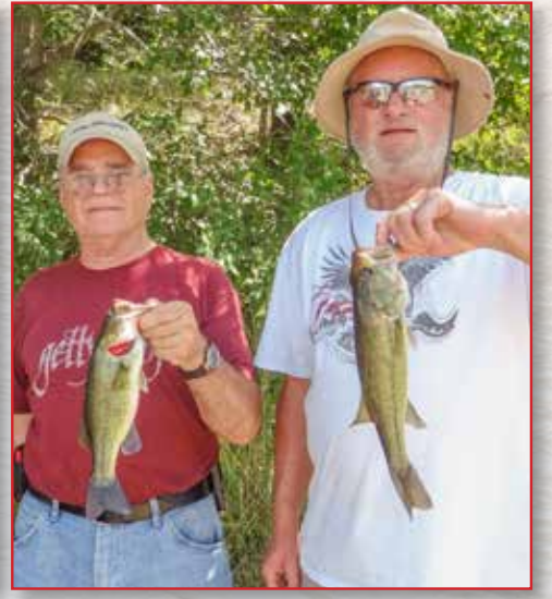
Hawg Hawlers Bass Club