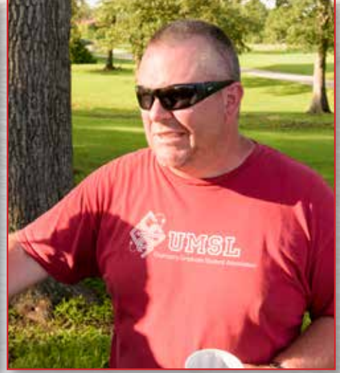
Hawg Hawlers Bass Club