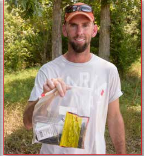
Hawg Hawlers Bass Club