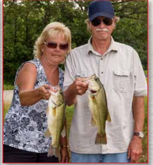
Hawg Hawlers Bass Club