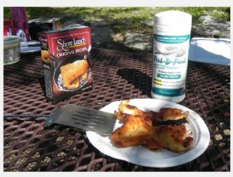
Use before lunch

What do you do after catching a fish? Wipe your hands on your pants? A Fish-D-Funk wipe will remove the odor (and slime) and save you from wearing the stink the rest of the day.