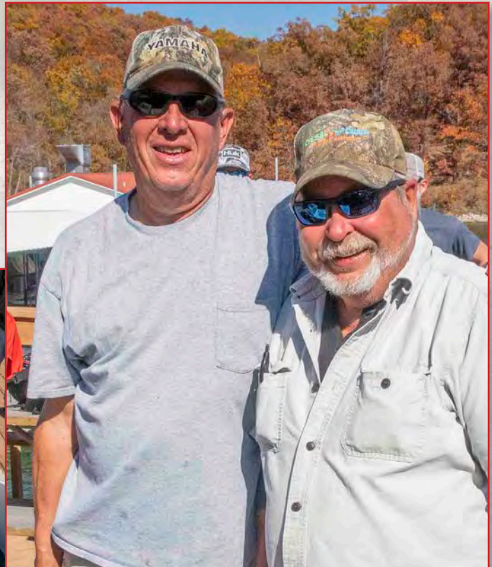
Coupla old Sticks