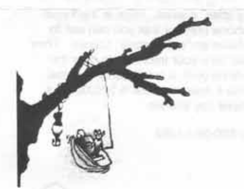
Fishin' The Treetops

The way bass position themselves on or within the cover can change throughout the day and should play a role in how close you get to casting targets. In early morning spring or fall fishing, bass may be at the very bottom of the bush, but once the sun warms the water, they'll move closer to the surface and suspend in the top where they can be spooked easily. That's when you need to back off and make longer casts.