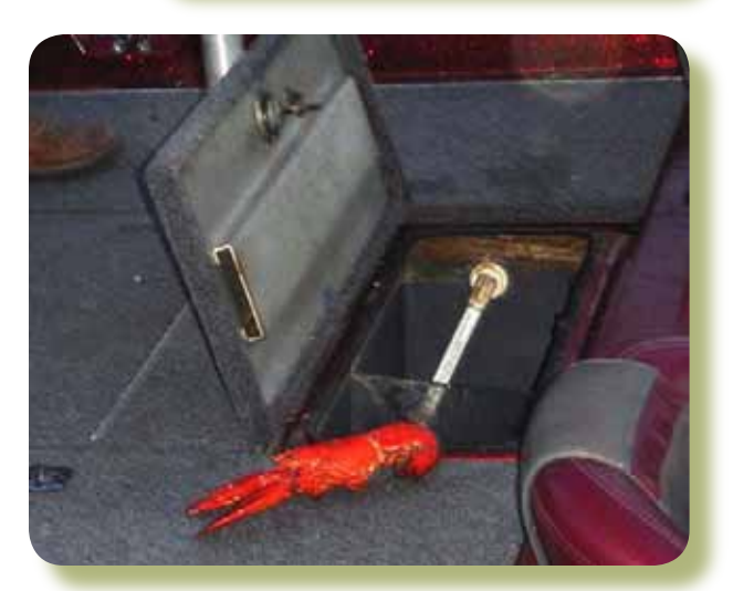
Now that's a big crawdad!