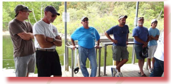
Hawg Hawlers Bass Club