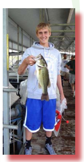
Dedicated to good fun, good friends and good fishing.