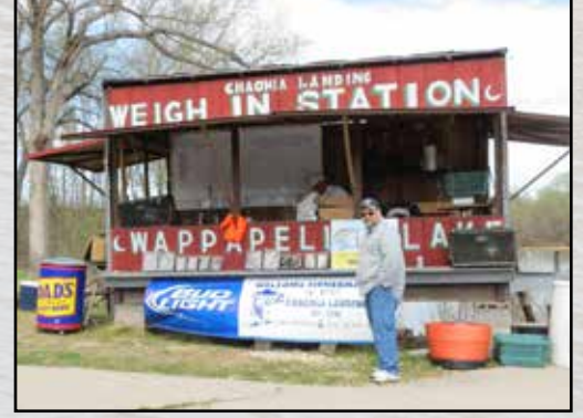
Hawg Hawlers Bass Club