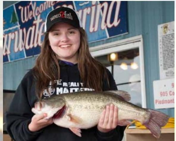
7 91 lbs