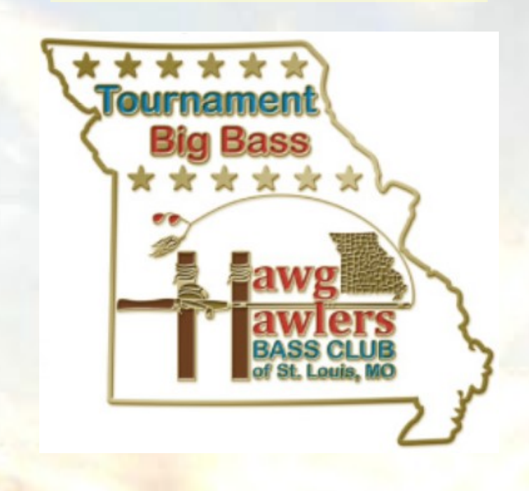
Big Bass Of The Day - Sunday

Jason Shaw caught the tournament big bass weighing in at 5.08 lbs on Saturday.