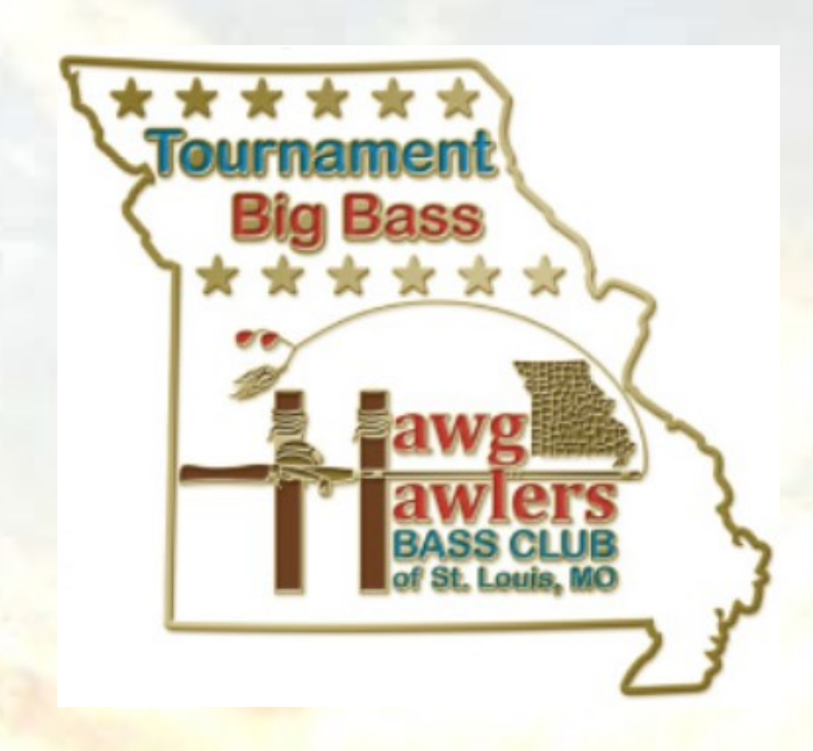
Big Bass Of The Day - Sunday

Corey Dickerson caught the tournament big bass weighing in at 5.63 lbs on Saturday